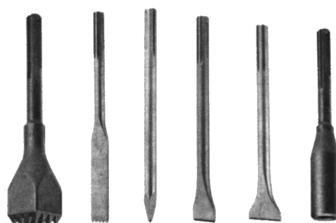
A B C D E F