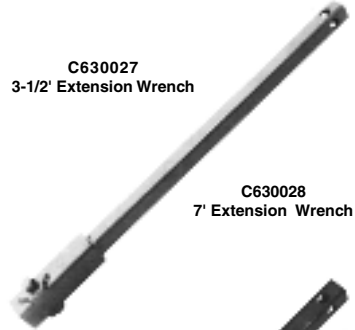
C630027 3-1/2' Extension Wrench