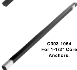
C303-1064 For 1-1/2" Core Anchors.

Drive-End Wrenches for 1-1/2" core anchors are painted with a yellow band on the ends, to distinguish them from the Drive-End Wrenches for 1-3/8" Core Anchors.