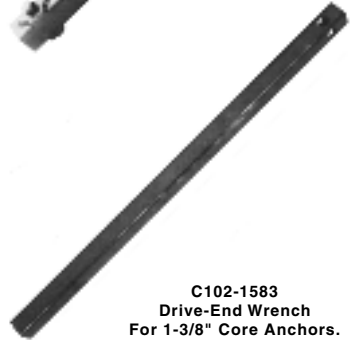
C102-1583 Drive-End Wrench For 1-3/8" Core Anchors.

NOTE: Wrenches will fit 15,000 ft.-lb. Tough One Anchors dimensionally, but . . . MUST NOT be used for torques in excess of 10,000 ft.-lb.!