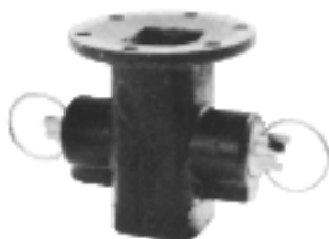
C303-0069HD H/D Locking Dog Assembly