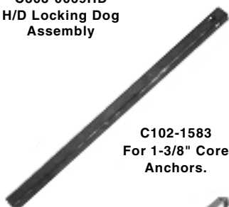
C102-1583 For 1-3/8" Core Anchors.