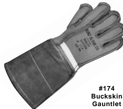
#174 Buckskin Gauntlet

Many additional styles are available. Consult your Reliable representative for more information.