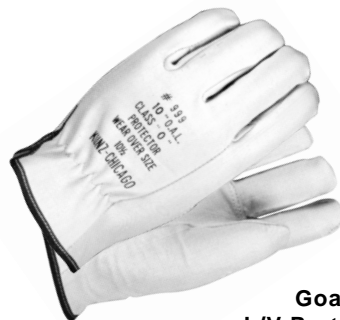
#999 Goatskin L/V Protector