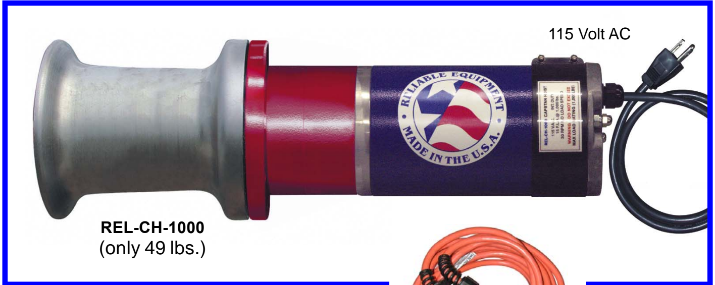
REL-CH-1000 (only 49 lbs.)

301 IVYLAND ROAD • WARMINSTER, PA 18974 • FAX: 215-357-9193 • TOLL FREE: 800-966-3530