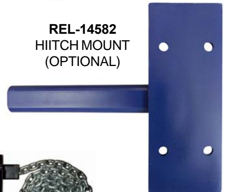
REL-14582 HIITCH MOUNT (OPTIONAL)