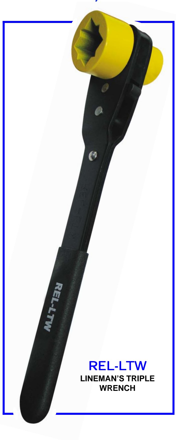
REL-LTW LINEMAN'S TRIPLE WRENCH